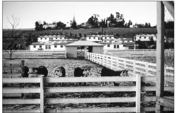
Veteran housing at Fullerton College, near the school farm, 1949

By the end of the second World War, Fullerton College (then Fullerton Junior College) had only 71 male students. Initially only 15 veterans enrolled in 1944-45, but by 1946-47, that figure had jumped to 843. The campus had the largest freshmen classes in its history, and men soon outnumbered women by two to one. In desperate need of federal funds, Fullerton College administrators applied for certification from the Readjustment Division of the California Department of Education, becoming in January 1946 one of six schools in Orange County approved to educate veterans under