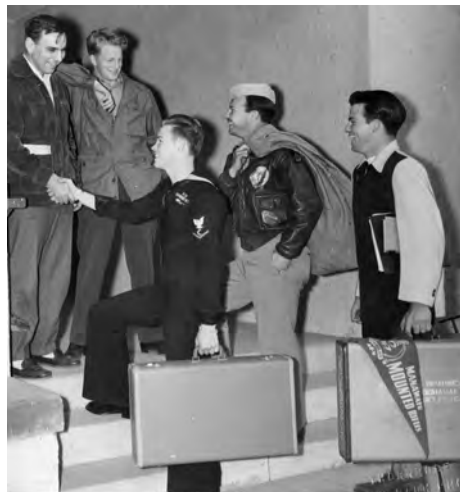
Residents at the Veterans' Home greet their new roommates.

The Veterans Administration provided a subsistence allowance of $50 a month for veterans without dependents and $75 for those with dependents. That money did not go far for veterans supporting families and many took part-time jobs on campus. A Veterans' Center was also set up on campus to advise veterans on matters pertaining to insurance, education, vocational benefits, loans, and any other activities that students wished to have explained. Special counseling was also established for the disabled, blind, or amputee veterans. To accommodate the young wives and