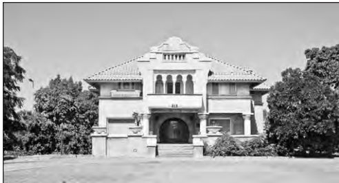
The John Hetebrink House, the finest example of residential Mission Revival architecture in Fullerton