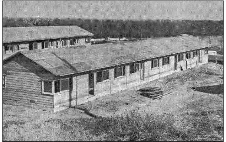
Veteran housing units being installed in 1946. The units remained on campus until 1955.