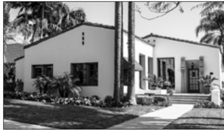
Johnson House on Brookdale Place.